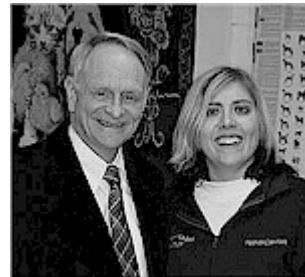
Cuyahoga Falls Mayor Robart visits the Adoption Center

Hooray ! Hooray! Hooray! Heaven Can Wait has a home of our own now! We are so pleased to announce that Heaven Can Wait has opened our own Adoption and Awareness Center and we all feel extremely blessed to have such a wonderful new center to call home. We opened our doors to the public February 8, 2007 and were full to capacity with so many familiar and new faces! We are located at 2765 Front St. in Cuyahoga Falls and are open for you to come visit with us and some of the happy rescues that also call the center home. Our adoption center houses cats we have saved and are available for adoption and dogs are shown when open and by appointment. We also have animal welfare information available to the public, items available for a donation, a meet and greet room available for potential adopters and perspective pets, main office for Heaven Can Wait, a supply room,, drop off for donated items and a location to hold animal meetings. Come see for yourself! Spring hours are: Tuesdays and Thursdays 4-7pm, Saturdays 12-4, Sundays 1-4, and by appointment.